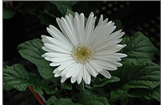
White Gerbera Daisy flowers