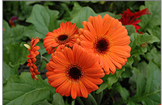
Orange Gerbera Daisy flowers