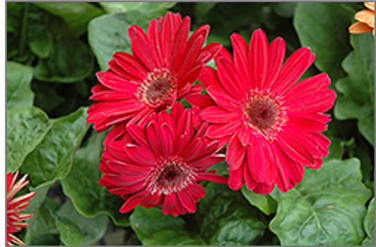
Fuchsia Gerbera Daisy flowers