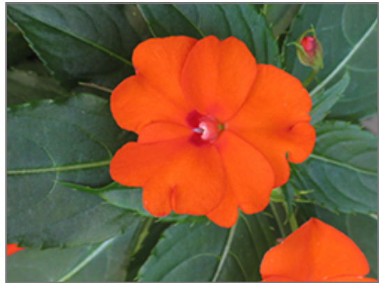
Infinity Orange New Guinea Impatiens flowers

Infinity Orange New Guinea Impatiens is recommended for the following landscape applications;