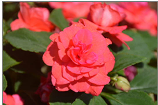
Rockapulco Coral Reef Impatiens flowers