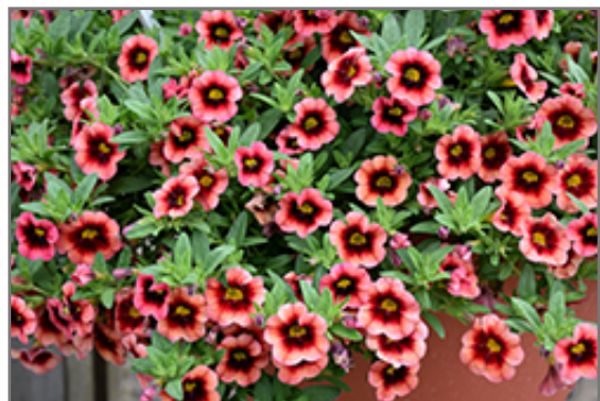
Superbells Coralberry Punch Calibrachoa flowers