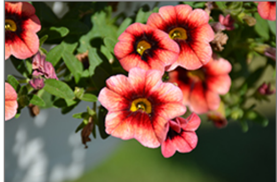
Superbells Coralberry Punch Calibrachoa flowers

Superbells Coralberry Punch Calibrachoa is a dense herbaceous annual with a trailing habit of growth, eventually spilling over the edges of hanging baskets and containers. Its medium texture blends into the garden, but can always be balanced by a couple of finer or coarser plants for an effective composition.