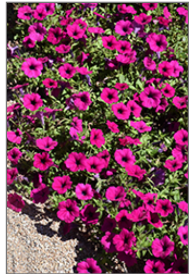
Wave Purple Classic Petunia flowers