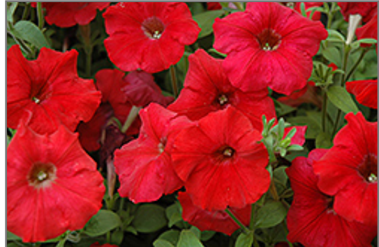
Easy Wave Red Petunia flowers

This plant will require occasional maintenance and upkeep. Trim off the flower heads after they fade and die to encourage more blooms late into the season. It is a good choice for attracting hummingbirds to your yard, but is not particularly attractive to deer who tend to leave it alone in favor of tastier treats. It has no significant negative characteristics.