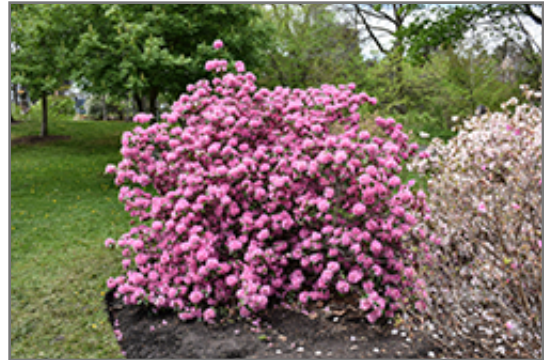
Aglo Rhododendron in bloom