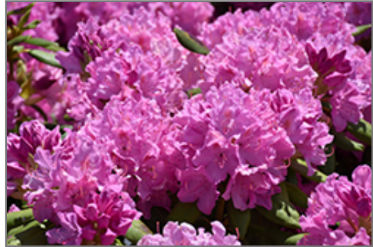
Roseum Elegans Rhododendron flowers