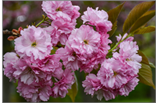
Kwanzan Flowering Cherry flowers

This tree should only be grown in full sunlight. It does best in average to evenly moist conditions, but will not tolerate standing water. It is not particular as to soil pH, but grows best in rich soils. It is highly tolerant of urban pollution and will even thrive in inner city environments, and will benefit from being planted in a relatively sheltered location. This is a selected variety of a species not originally from North America.