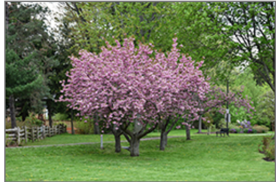
Kwanzan Flowering Cherry in bloom