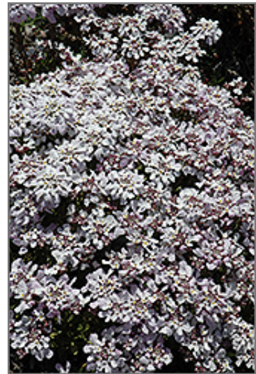
Pink Ice Candytuft flowers

Often treated as a perennial, this is actually a low growing shrub; features a froth of showy pink flowers in spring that mature to a dazzling lilac; tidy evergreen foliage for the rest of the year; good for groundcover, containers, and general garden use