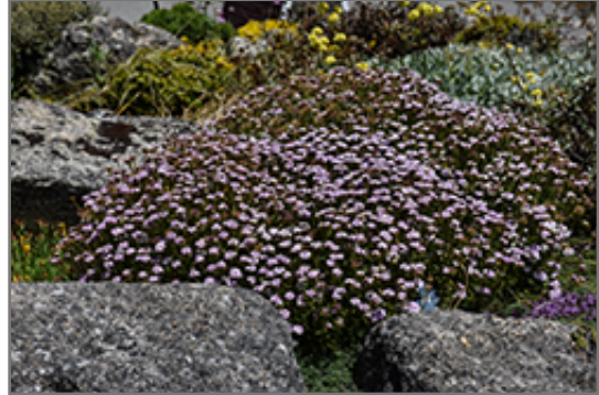
Pink Ice Candytuft in bloom

Pink Ice Candytuft will grow to be only 6 inches tall at maturity extending to 8 inches tall with the flowers, with a spread of 24 inches. When grown in masses or used as a bedding plant, individual plants should be spaced approximately 18 inches apart. Its foliage tends to remain low and dense right to the ground. It grows at a fast rate, and under ideal conditions can be expected to live for approximately 10 years. As an evergreen perennial, this plant will typically keep its form and foliage year-round.