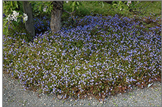
Georgia Blue Speedwell in bloom

Georgia Blue Speedwell will grow to be only 4 inches tall at maturity extending to 6 inches tall with the flowers, with a spread of 24 inches. When grown in masses or used as a bedding plant, individual plants should be spaced approximately 18 inches apart. Its foliage tends to remain low and dense right to the ground. It grows at a fast rate, and under ideal conditions can be expected to live for approximately 10 years. As an herbaceous perennial, this plant will usually die back to the crown each winter, and will regrow from the base each spring. Be careful not to disturb the crown in late winter when it may not be readily seen!