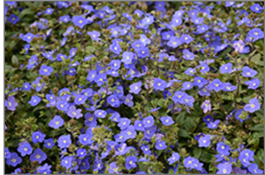
Georgia Blue Speedwell flowers

This is a relatively low maintenance plant, and is best cleaned up in early spring before it resumes active growth for the season. It is a good choice for attracting butterflies to your yard, but is not particularly attractive to deer who tend to leave it alone in favor of tastier treats. It has no significant negative characteristics.