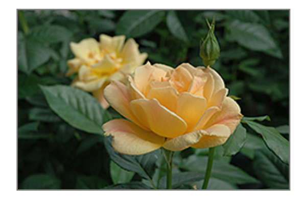
Easy Going Rose flowers