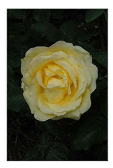
Easy Going Rose flowers