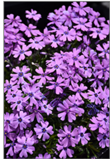
Purple Beauty Moss Phlox flowers

Purple Beauty Moss Phlox is recommended for the following landscape applications;