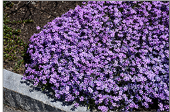
Purple Beauty Moss Phlox in bloom