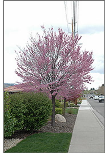
Eastern Redbud (tree form) in bloom

This tree does best in full sun to partial shade. It prefers to grow in average to moist conditions, and shouldn't be allowed to dry out. It is not particular as to soil type or pH. It is highly tolerant of urban pollution and will even thrive in inner city environments, and will benefit from being planted in a relatively sheltered location. Consider applying a thick mulch around the root zone in winter to protect it in exposed locations or colder microclimates. This is a selection of a native North American species.