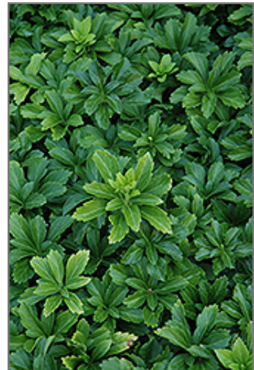
Green Sheen Japanese Spurge foliage