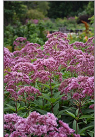
Joe Pye Weed flowers