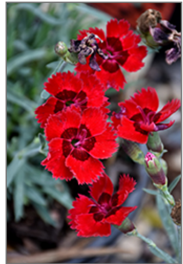
Fire Star Pinks flowers

Fire Star Pinks is recommended for the following landscape applications;