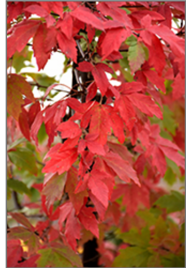
Paperbark Maple in fall

This tree does best in full sun to partial shade. It prefers to grow in average to moist conditions, and shouldn't be allowed to dry out. It is not particular as to soil type or pH. It is somewhat tolerant of urban pollution. This species is not originally from North America.