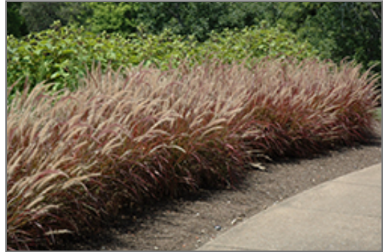
Purple Fountain Grass in bloom

Purple Fountain Grass will grow to be about 4 feet tall at maturity, with a spread of 3 feet. Although it's not a true annual, this plant can be expected to behave as an annual in our climate if left outdoors over the winter, usually needing replacement the following year. As such, gardeners should take into consideration that it will perform differently than it would in its native habitat.