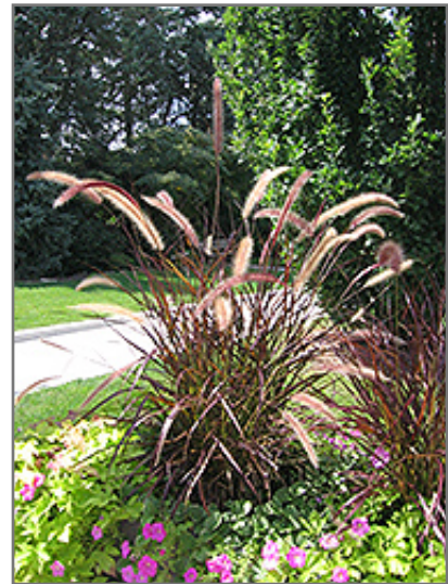
Purple Fountain Grass flowers

Purple Fountain Grass is recommended for the following landscape applications;