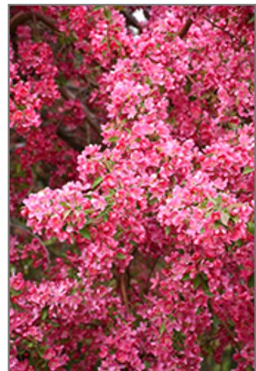
Prairifire Flowering Crab flowers