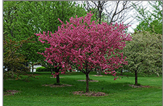
Prairifire Flowering Crab in bloom

Prairifire Flowering Crab is recommended for the following landscape applications;