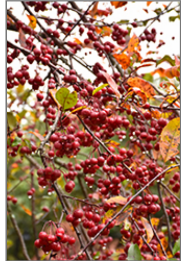
Prairifire Flowering Crab fruit

This tree should only be grown in full sunlight. It prefers to grow in average to moist conditions, and shouldn't be allowed to dry out. It is not particular as to soil type or pH. It is highly tolerant of urban pollution and will even thrive in inner city environments. This particular variety is an interspecific hybrid.