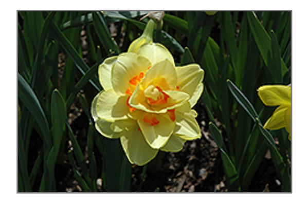
Tahiti Daffodil flowers