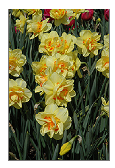
Tahiti Daffodil flowers