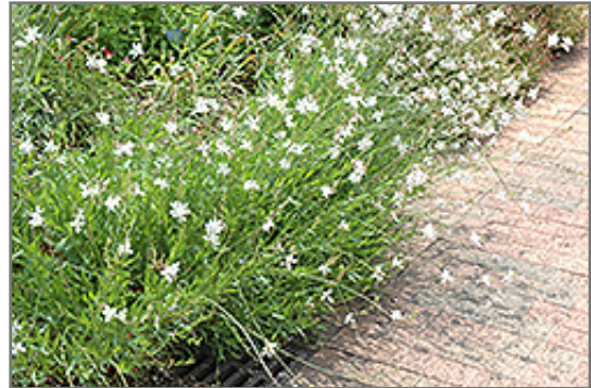
Whirling Butterflies Gaura in bloom