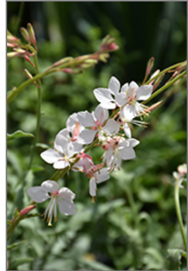
Whirling Butterflies Gaura flowers

This is a relatively low maintenance plant, and is best cleaned up in early spring before it resumes active growth for the season. It is a good choice for attracting butterflies to your yard, but is not particularly attractive to deer who tend to leave it alone in favor of tastier treats. It has no significant negative characteristics.