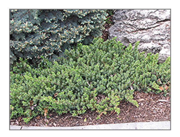
Dwarf Japanese Garden Juniper

This is a relatively low maintenance shrub, and is best pruned in late winter once the threat of extreme cold has passed. Deer don't particularly care for this plant and will usually leave it alone in favor of tastier treats. It has no significant negative characteristics.