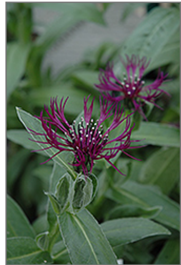
Amethyst Dream Cornflower flowers