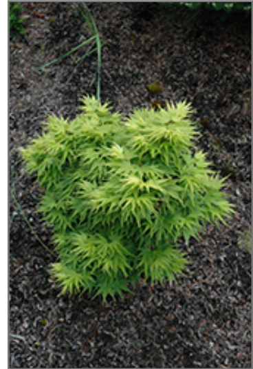
Mikawa Yatsubusa Japanese Maple

Mikawa Yatsubusa Japanese Maple is a fine choice for the yard, but it is also a good selection for planting in outdoor pots and containers. With its upright habit of growth, it is best suited for use as a 'thriller' in the 'spiller-thriller-filler' container combination; plant it near the center of the pot, surrounded by smaller plants and those that spill over the edges. It is even sizeable enough that it can be grown alone in a suitable container. Note that when grown in a container, it may not perform exactly as indicated on the tag - this is to be expected. Also note that when growing plants in outdoor containers and baskets, they may require more frequent waterings than they would in the yard or garden.