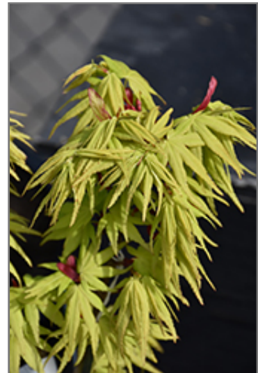
Mikawa Yatsubusa Japanese Maple foliage

Mikawa Yatsubusa Japanese Maple is recommended for the following landscape applications;