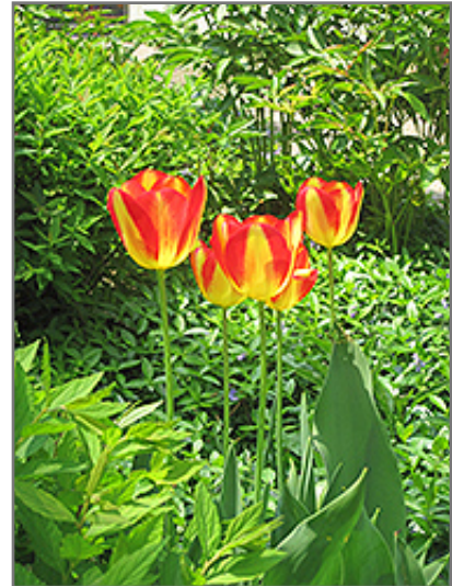
Antoinette Tulip in bloom