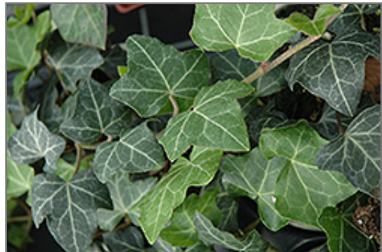
Baltic Ivy foliage