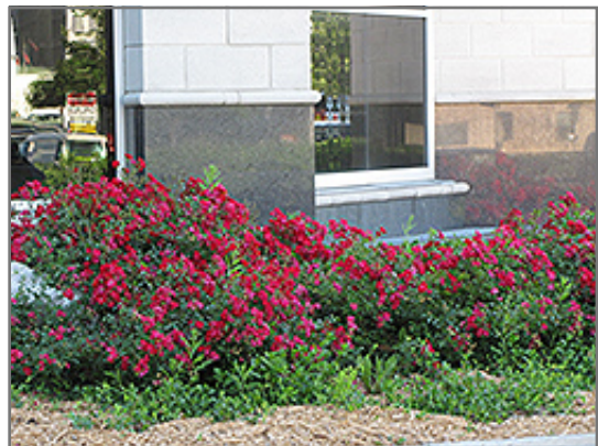
Flower Carpet Red Rose in bloom