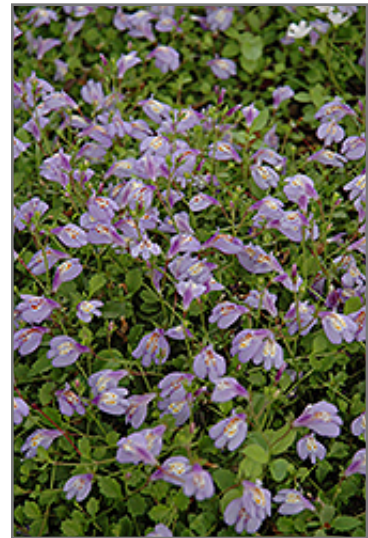
Creeping Mazus flowers

Creeping Mazus is recommended for the following landscape applications;