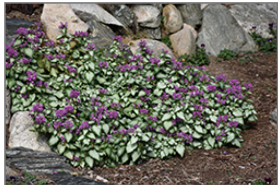
Purple Dragon Spotted Dead Nettle in bloom