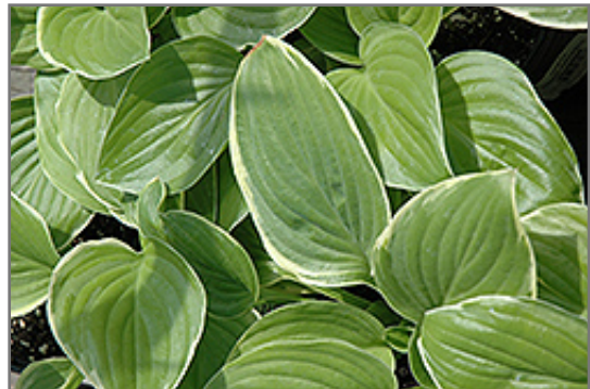
Frozen Margarita Hosta foliage

Frozen Margarita Hosta is recommended for the following landscape applications;