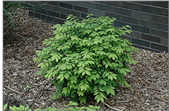
Little Moses Burning Bush