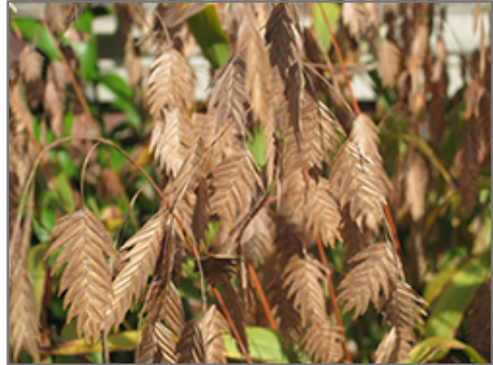
Northern Sea Oats fruit

Northern Sea Oats will grow to be about 4 feet tall at maturity, with a spread of 30 inches. Its foliage tends to remain dense right to the ground, not requiring facer plants in front. It grows at a medium rate, and under ideal conditions can be expected to live for approximately 10 years. As an herbaceous perennial, this plant will usually die back to the crown each winter, and will regrow from the base each spring. Be careful not to disturb the crown in late winter when it may not be readily seen!