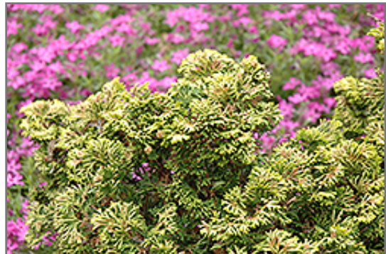
Verdon Dwarf Hinoki Falsecypress foliage