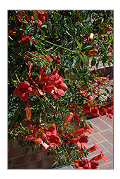
Flamenco Trumpetvine in bloom