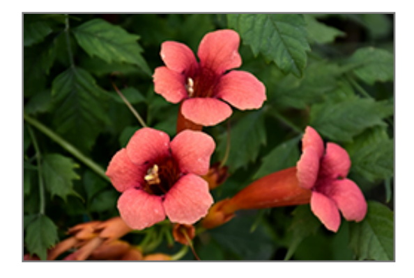
Flamenco Trumpetvine flowers