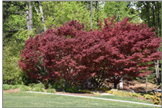
Suminagashi Japanese Maple