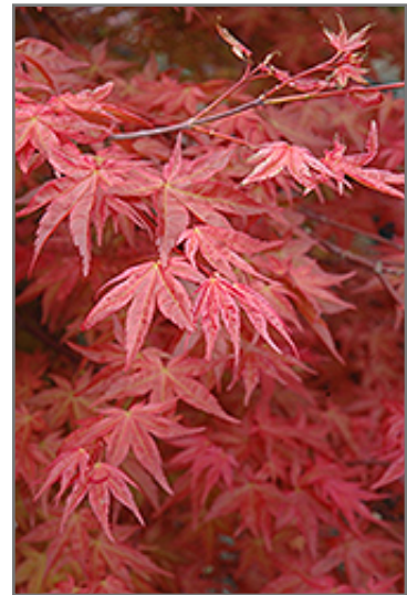
Suminagashi Japanese Maple foliage

This tree does best in full sun to partial shade. You may want to keep it away from hot, dry locations that receive direct afternoon sun or which get reflected sunlight, such as against the south side of a white wall. It prefers to grow in average to moist conditions, and shouldn't be allowed to dry out. It is not particular as to soil pH, but grows best in rich soils. It is somewhat tolerant of urban pollution, and will benefit from being planted in a relatively sheltered location. Consider applying a thick mulch around the root zone in winter to protect it in exposed locations or colder microclimates. This is a selected variety of a species not originally from North America.