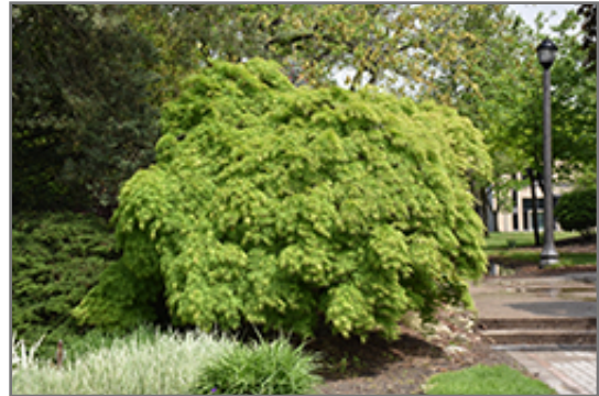
Cutleaf Japanese Maple