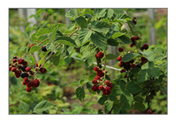
Chester Thornless Blackberry fruit

This shrub may not always play well with others; as such, it is best grown in its own designated garden space or isolated area of an edibles garden. It should only be grown in full sunlight. It prefers to grow in average to moist conditions, and shouldn't be allowed to dry out. It is not particular as to soil type or pH. It is somewhat tolerant of urban pollution. This particular variety is an interspecific hybrid. It can be propagated by division; however, as a cultivated variety, be aware that it may be subject to certain restrictions or prohibitions on propagation.