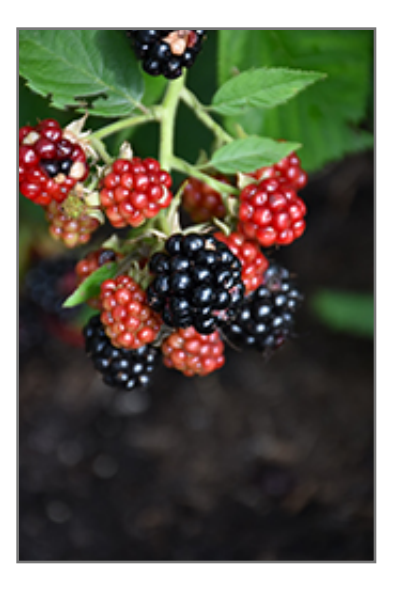
Chester Thornless Blackberry fruit

Chester Thornless Blackberry has rich green deciduous foliage on a plant with a spreading habit of growth. The fuzzy oval compound leaves do not develop any appreciable fall color. It features an abundance of magnificent black berries in mid summer.