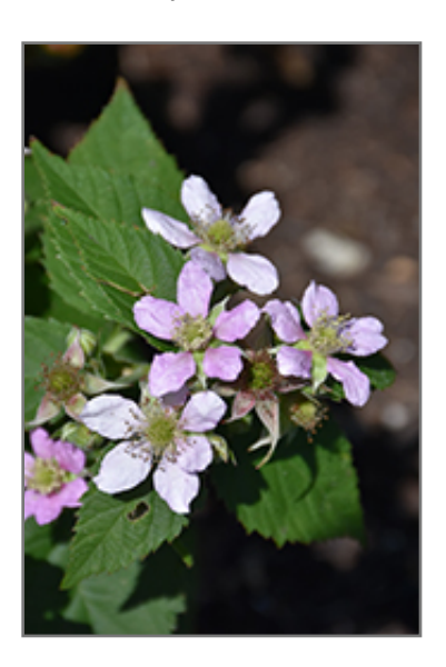
Chester Thornless Blackberry flowers