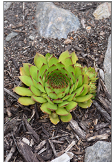
Sunset Hens And Chicks