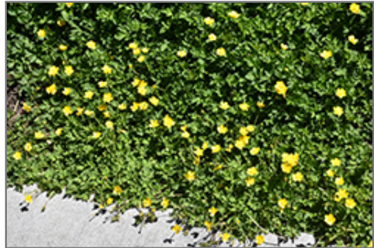
Barren Strawberry in bloom