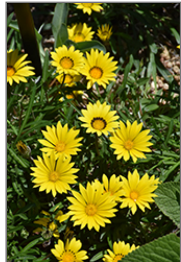
Colorado Gold Gazania flowers

Colorado Gold Gazania is recommended for the following landscape applications;