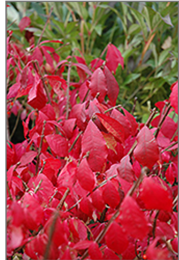
Burning Bush (tree form) in fall