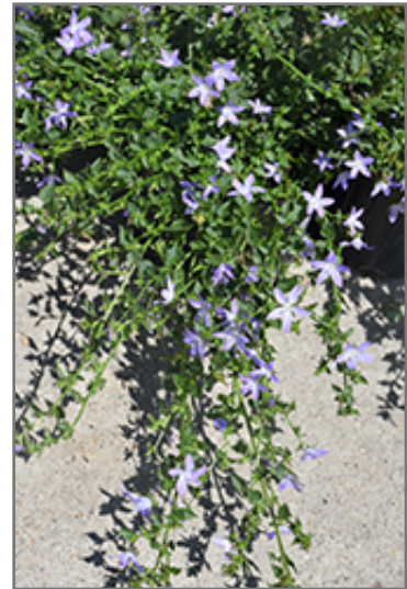
Blue Waterfall Serbian Bellflower in bloom