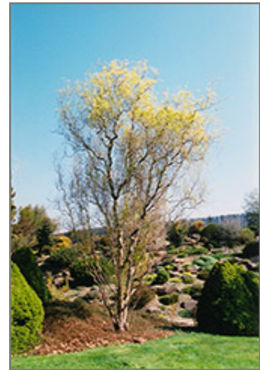
Dragon's Claw Willow in winter

Dragon's Claw Willow will grow to be about 30 feet tall at maturity, with a spread of 25 feet. It has a low canopy with a typical clearance of 2 feet from the ground, and should not be planted underneath power lines. It grows at a fast rate, and under ideal conditions can be expected to live for 40 years or more.