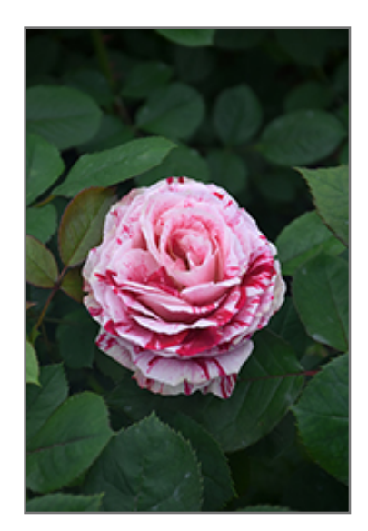
Scentimental Rose flowers