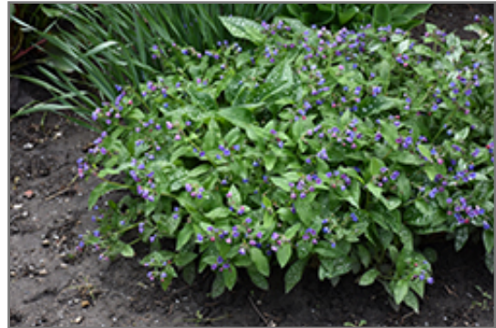
Dark Vader Lungwort in bloom