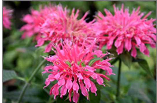
Coral Reef Beebalm flowers

Coral Reef Beebalm is recommended for the following landscape applications;