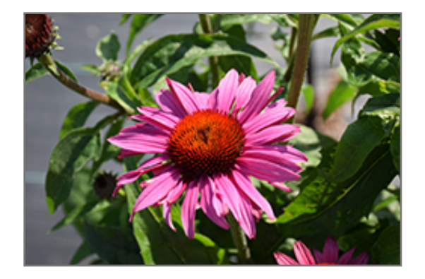
Prairie Splendor Compact Dark Rose Coneflower flowers